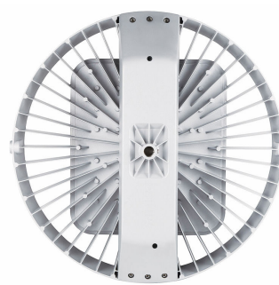
GreenPerform Highbay HT