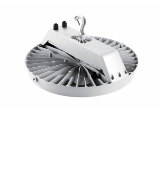
GreenPerform Highbay HT