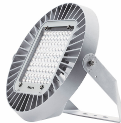
GreenPerform Highbay HT