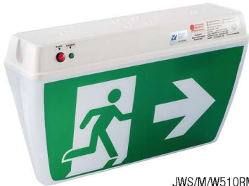
JWS/M/W510RM (E) Running-man graphical exit signs comply to latest SS563 & SS508

SMT LED with lifespan 50,000 burning hours Indoor, outdoor, corrosion resistant weatherproof emergency exit light