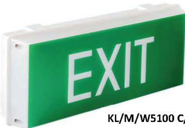
KL/M/W5100 C/W HS