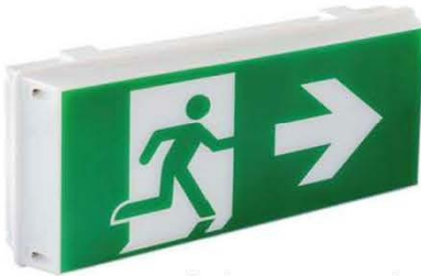
KL/M/W510RM (E) C/W HS